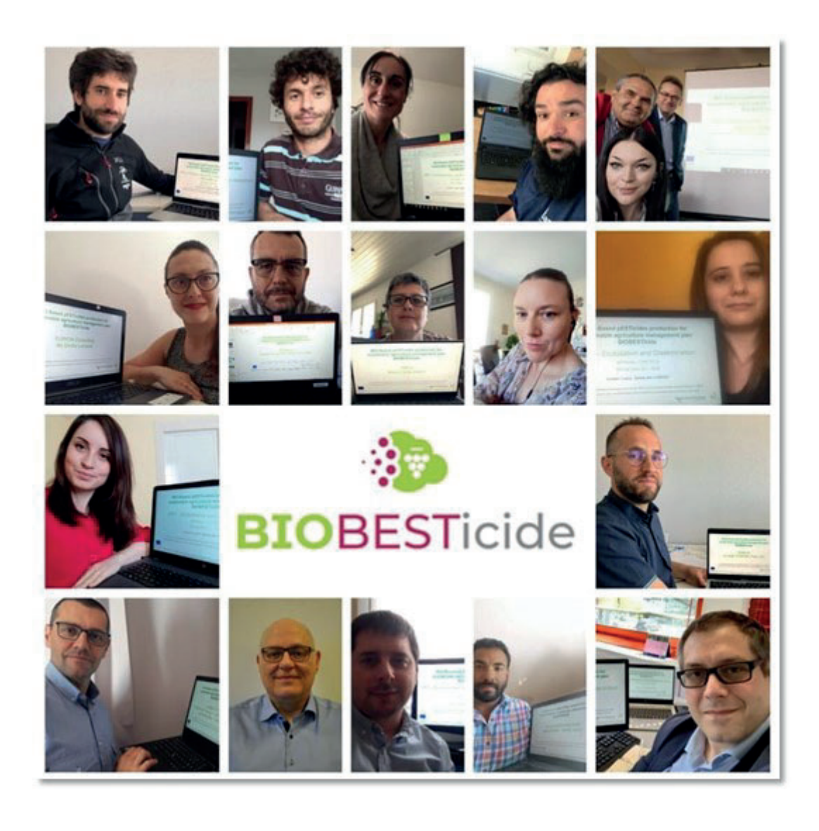
Let's get to know better the partners and their involvement in the project activities!

The BIOBESTicide consortium is composed by 10 partners from 5 European countries, which met for the first time during the online Kick-off-Meeting, held on May 26<sup>th</sup>, 2020 to discuss the work plan for the next 3 years and the main activities.